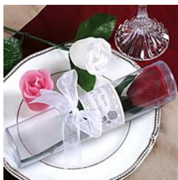
TABLE GIFTS AND FAVOURS

The hotel can arrange a photographer or videographer, or we are happy to put you in touch with local companies.